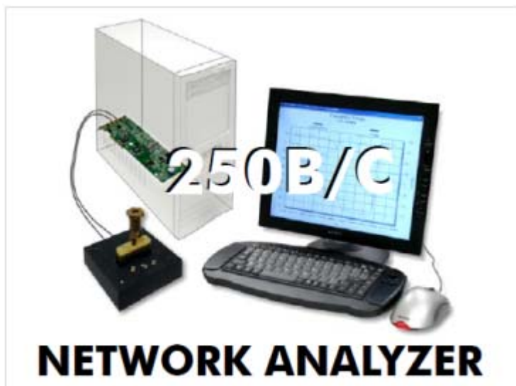
Figure 1. 250B/C Network Analyzer

A simple analysis in sweeping the drive level can be performed to verify changes in both resistance and frequency of the crystal. This analysis, typically called Drive Level Dependence (DLD), can be taken using a Saunders & Associates (S&A) 250B/C desktop network analyzer. Refer to figure 1. S&A manufacturers test and production systems for quartz crystals, oscillators, filters, and components. It has become an industry standard and preferred test system by many of the leading crystal manufactures. This desktop system is relatively inexpensive and is essential if designing or using silicon component, which require quartz crystals.