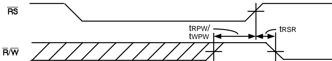
Figure 2. Reset Requirements