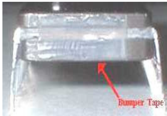
Figure 2: New material - Bumper tape