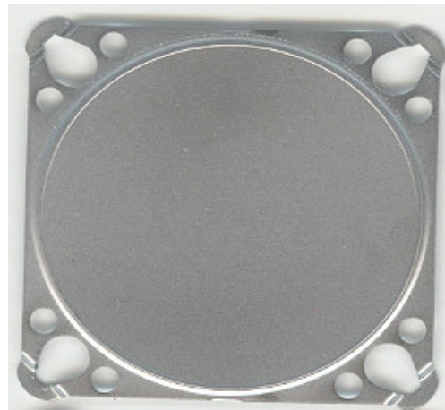
Matte heat spreader

Customers may expect to receive shipments of products in new heat spreader appearance no sooner than 90 days from the date of this PCN notification. Shipments to customers may contain products that are with new and old heat spreader appearance during the transition period and until the existing inventories have been depleted.